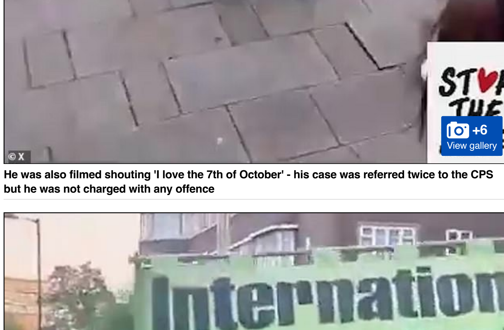
The rally was met by counter-protesters in a series of marches which have taken place regularly since the start of the conflict