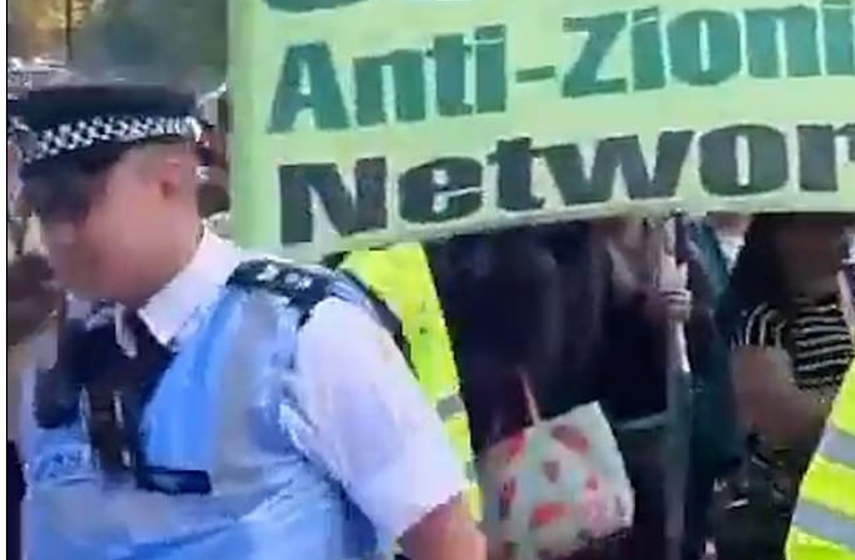
The rally was met by counter-protesters in a series of marches which have taken place regularly since the start of the conflict