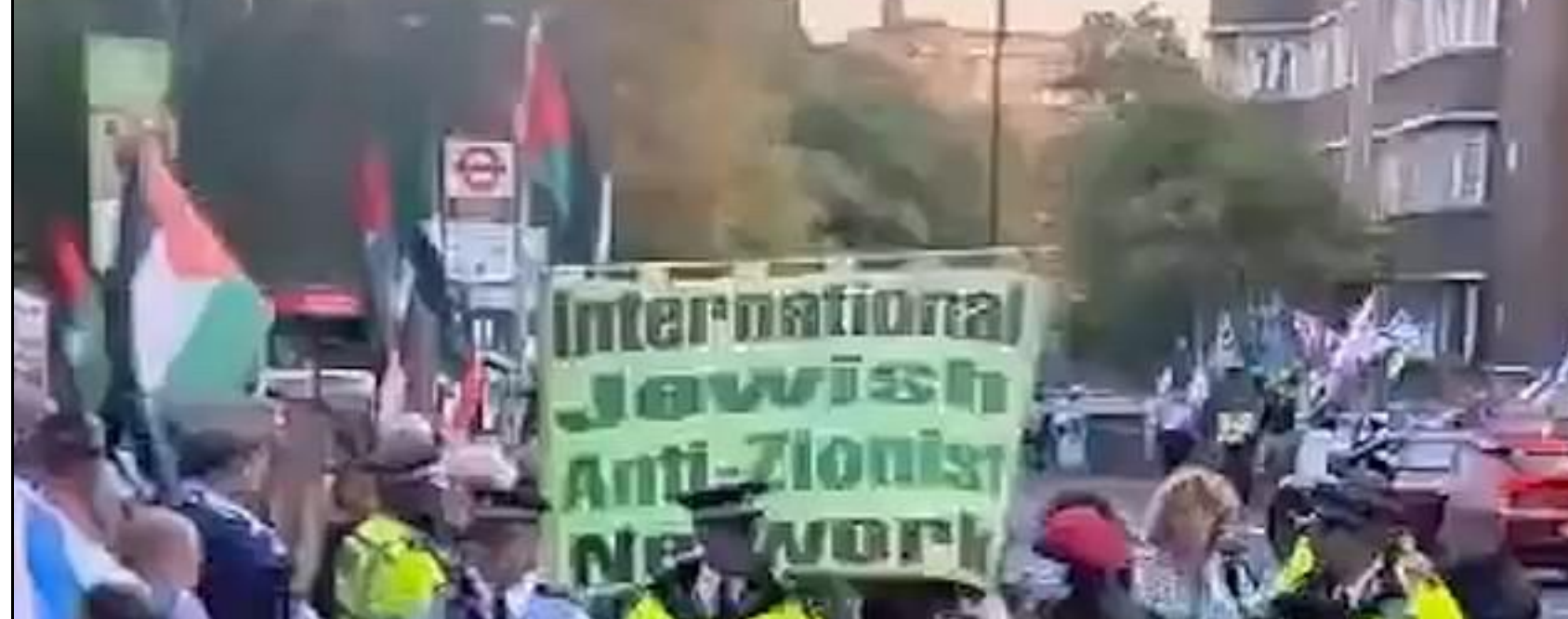
He was also filmed shouting 'I love the 7th of October' - his case was referred twice to the CPS but he was not charged with any offence