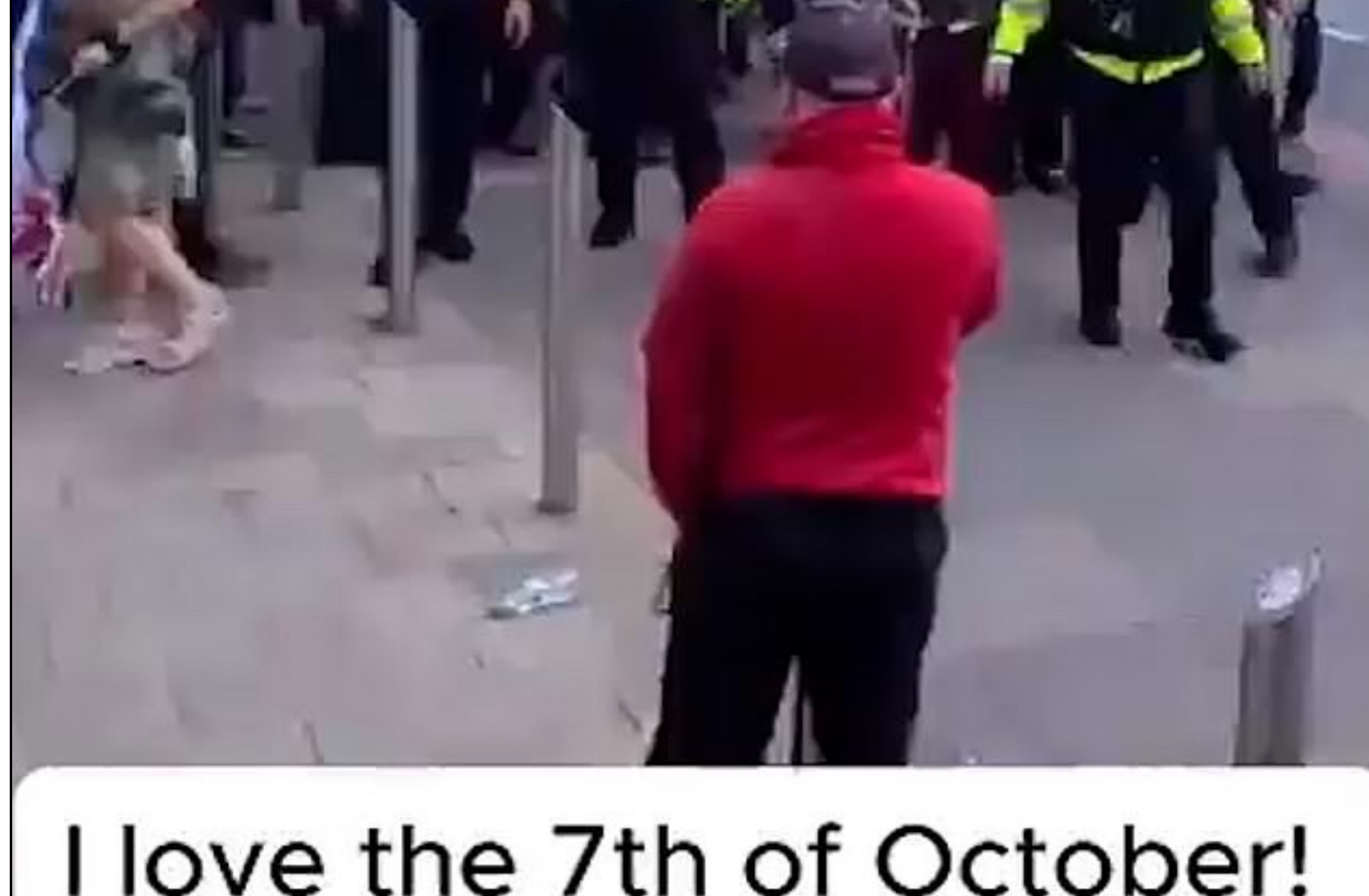
The rally was met by counter-protesters in a series of marches which have taken place regularly since the start of the conflict